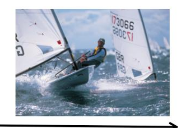
Modelo de desenvolvimento de velejador a longo prazo

L.T.A.D. (LONG TERM ATHLETE DEVELOPMENT) applied to Portuguese Sailing